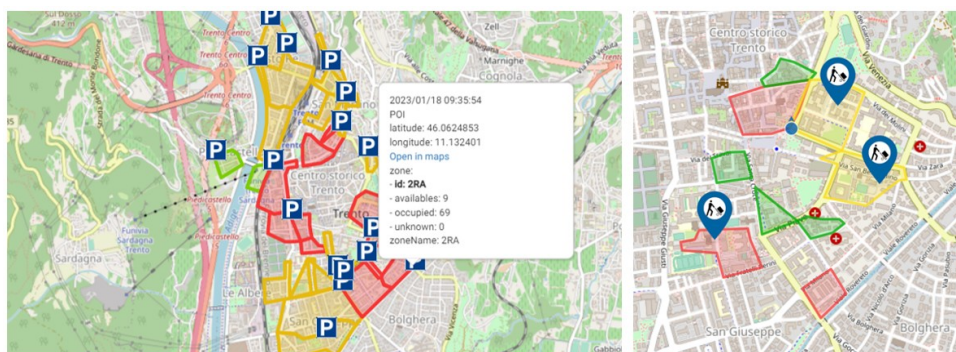
Figure 9.2: Example of on-street parking area and space

of each parking space, and it is also possible to indicate the reserved spaces for loading and unloading of the goods, for disabled or women drivers, to name a few.